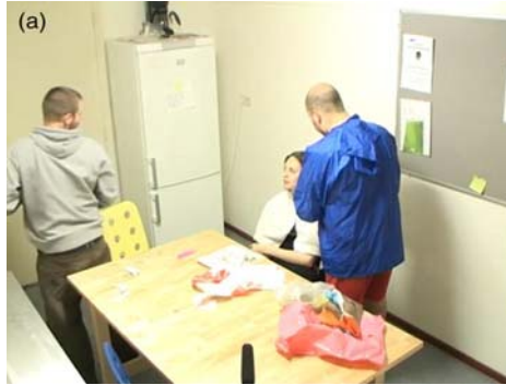
IMAGE 6A Line 7: “To blow the nose?”. B initiates repair and briefly holds his head direction.