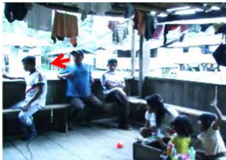
IMAGE 1A Speaker A (off camera) asks “How much are washu trees?” Speaker B (on bench, in the middle) begins to turn his head and gaze toward speaker A as he says “huh?” He then holds this position while speaker A repeats “washu trees, how much are they?”