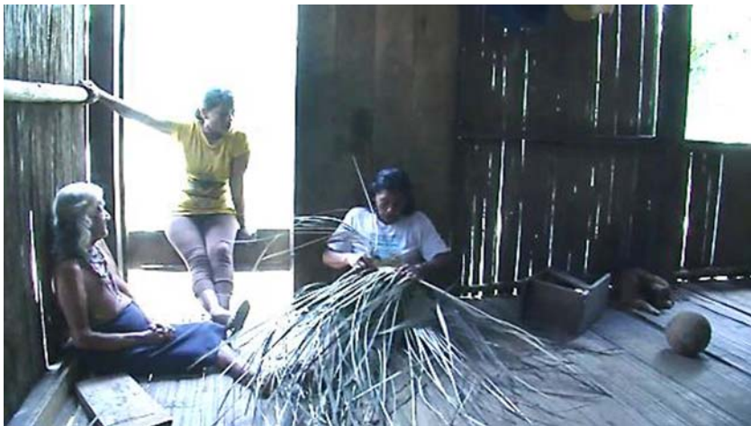
IMAGE 5 'baskets?', speaker B on the right initiates repair on A, in the center; B is occupied with weaving a basket and does not display or hold any relevant bodily behavior as A confirms: "yes".

((B is making a basket and does not look up))