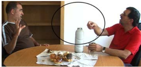
IMAGE 2A “...WHAT...?” participant B, right, initiates repair in line 4 by using manual (...what?) and nonmanual signs (wrinkled nose, eyebrows together, and upward head tilt.) holding them until participant A solves the sequence.