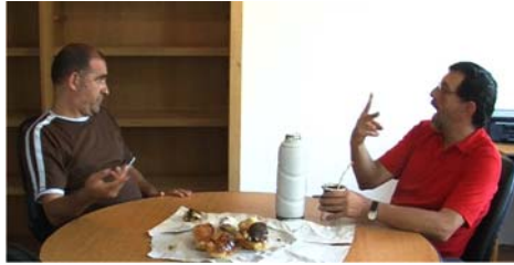
IMAGE 2B ‘... BOTH ...’, participant A, on the left, end of the solution turn. “Ah, ... both ”, participant B, on the right, displays information uptake and confirms the repair solution in line 5 by manual (... both ) and nonmanual signs (head down and wide open mouth).