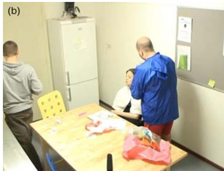
IMAGE 6B Line 8: B disengages head position before A’s confirmation (“yes”) in line 9.

not occur in OIR sequences were varied, but they were primarily related to practical activities that required attention or to instances in which the bodily configurations of the participants complicated mutual visual perception. Such instances were common in the spoken language corpora, and we take the lack of holds in these cases to be evidence of the flexibility of the repair system. The fact that a small percentage of LSA cases also featured no discernable hold indicates that some instances of lack of holds in OIR sequences may also be interactionally meaningful independently of complicating circumstances in ways that further study may uncover, both in signed and spoken languages.