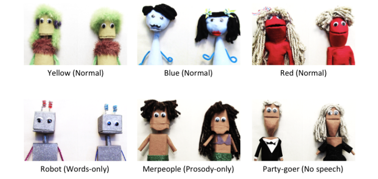
Figure 1: The six puppet pairs (and associated audio conditions). Each pair was linked to three distinct conversations from the same condition across the three experiment versions.

Audio-recordings We recorded six 20-25 second twoperson conversations for use in the puppet videos. Each of the six conversations featured a native English-speaking male and female talker. Talkers were directed to improvise a short conversation on a given topic (one of: 'riding bikes', 'pets', 'breakfast', 'birthday cake', 'rainy days', 'the library'). We asked talkers to talk "as if they were on a children's television show" to establish a child-friendly style. We gave talkers approximately five minutes to work out a basic conversation and then perform it with minimal practice. We edited each conversation to a 20-25 second clip for use in the final video stimuli.