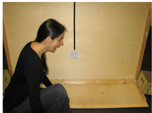
Fig. 3. Photograph showing the experimenter's position behind the barrier during the test phase in Study 2.

Again, the 16-month-olds' performance was significantly above chance, even on their first trial (sign test, p < .01 , g = .28 ), with 78% of the infants going to the correct box. Overall, across the four trials, performance was also better than chance (mean number of correct trials = 2.53, SD = 0.70 ; Wilcoxon signed-rank exact test: T^+ = 120 , N = 15 , p < .001 ; r = .60 ), although again some infants developed a side bias. Thirteen of the 19 infants who showed a side bias had gone to the correct box on their first trial and then persisted in going to the same